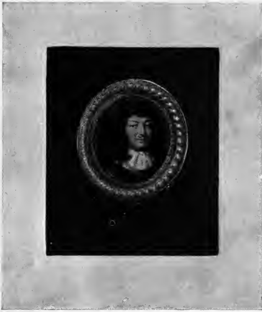
LOUIS XIV BY JEAN PETITOT, THE ELDER

PLATE XXXV LOUIS XIV BY JEAN PETITOT, THE ELDER